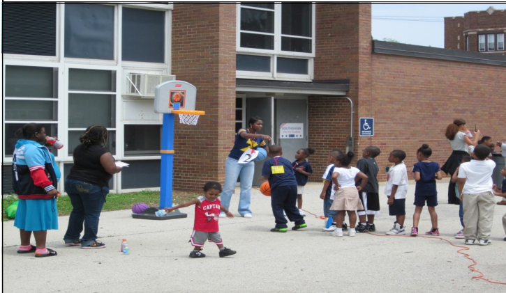
SSFAA staff, students & families enjoy the Inaugural Kids Field Day Event!